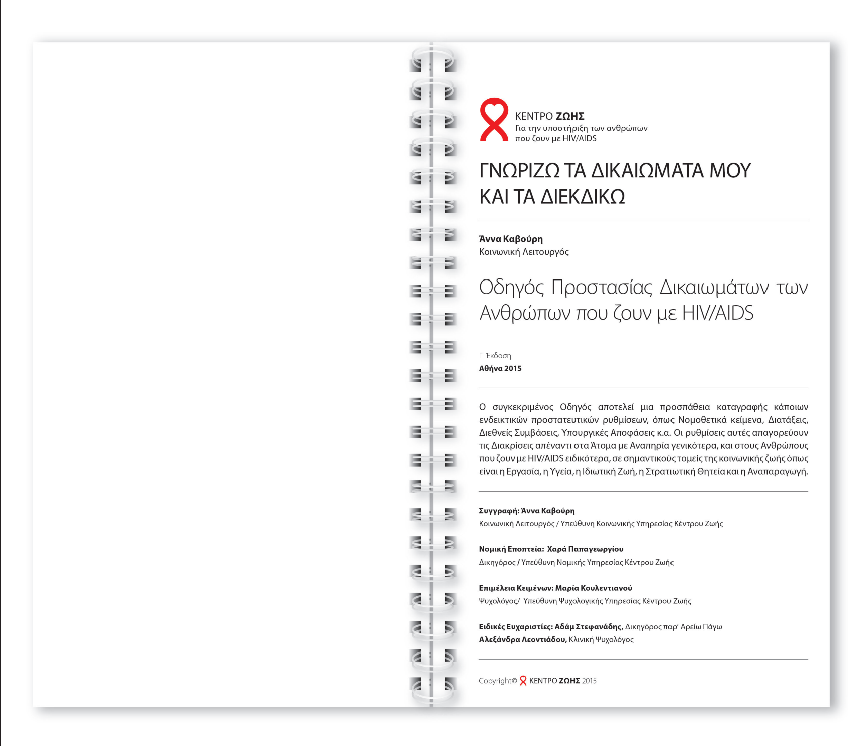
Social Rights Guide Booklet for HIV positive people

→ Organizing educative and informative seminars (Last year's theme was "Woman & HIV").